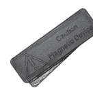
Name badge magnet (Available at additional cost)