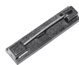
Bar pin, Black or White (Standard fitting)